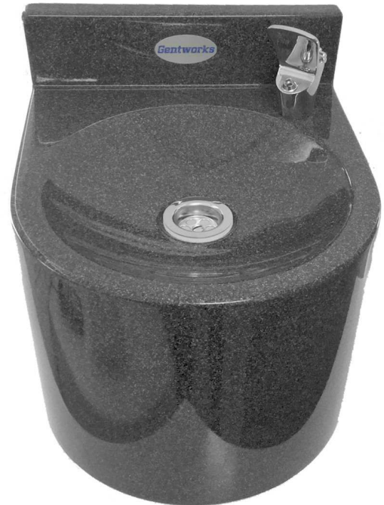
GWDF02 Drinking Fountain

This wall mounted drinking fountain is constructed from Glass Fibre Reinforced Polyester Resin, the same tough material often used for boat hulls. The smooth gel-coat finish is resistant to staining and damage as well as easy to clean, without the need for strong cleaning products. The drinking fountain is also corrosion resistant making it more suitable than stainless steel for chlorine or salt water environments. It can be installed at adult or junior height. The shielded bubbler valve is positioned for ease of use and the smooth radiused design eliminates sharp corners which could cause injury. It comes with a half-height undershroud to conceal the water supply and waste connections and bottom panel to discourage access to these service. Each drinking fountain is supplied with a 32mm flush grated waste fitting and a chrome plated shielded bubbler (or swan-neck bottle filler) complete with a self-closing push button valve. The valve incorporates a flow adjuster and strainer and is supplied with a water inlet fitting to suit 15mm diameter pipe-work.